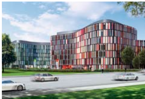
Cologne Oval Offices

Munich Re's second administrative location in Munich – 85 metres and 23 storeys high – opened in 2004 is fitted throughout with environmentally friendly technology. In the summer ground water circulates through the walls in a system of pipes to keep the rooms cool. Fresh air is drawn in through a 100 metre long underground canal for ventilation and the external sun-blinds reflect daylight onto the ceilings. The reward for all these innovations and more is an energy requirement in the Münchner Tor building that is well below that of comparable buildings in Germany at just 237 kilowatt hours per square metre per year.