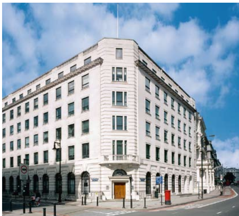
Grosvenor Place, London