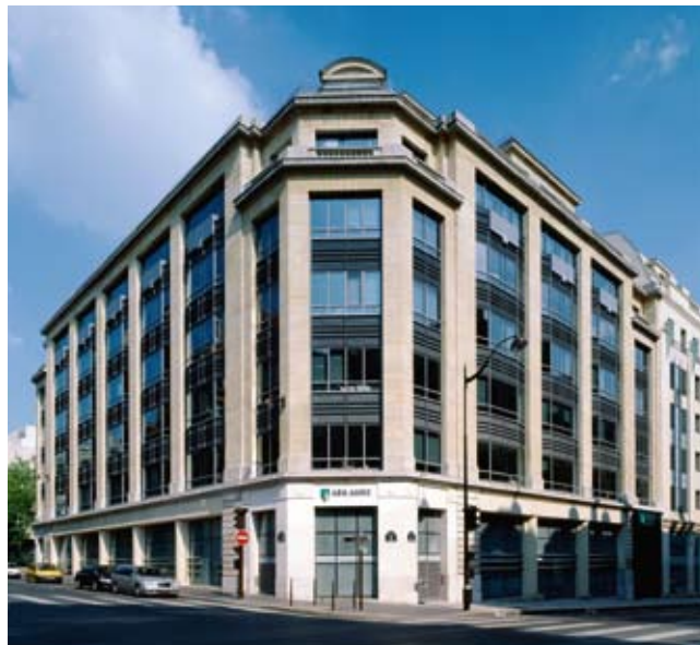
Rue de Courcelles, Paris

In this way, MEAG finds the right investment for our clients and partners – expertly, creatively, successfully.