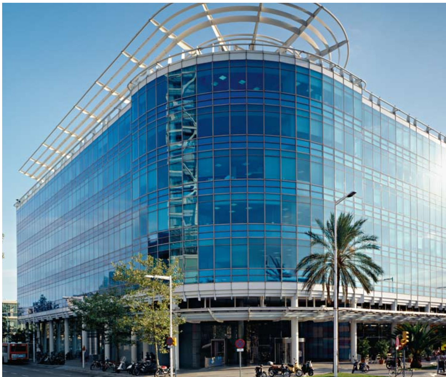
Blue Building, Barcelona

MEAG is a partner to institutional clients. Integrated real estate investment management means we cover all key activities of the real estate value chain for you.