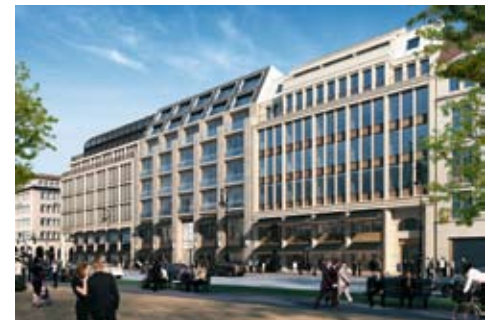
Upper Eastside Berlin

We are equipping this building on the corner of Friedrichstraße/Unter den Linden (completion 2008) with circulating heat exchangers and building automation (for example, for the control of the sun-blinds) to ensure a high level of energy efficiency and low operating costs. In doing so we undercut the EnEV 2007 requirements by around 50 percent. Because ecological thinking pays.